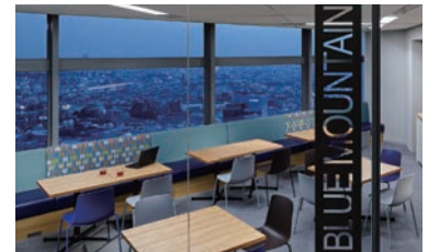
Manulife Japan Head Office