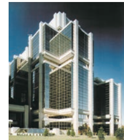
Head office in Canada